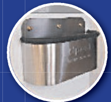
Dipper Well (Optional)