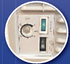
Control Panel (right)