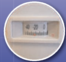
Temperature Display (front)