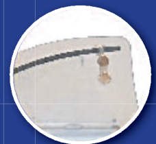
Upper Corner Connection (Canopy top not suitable for product expediting)